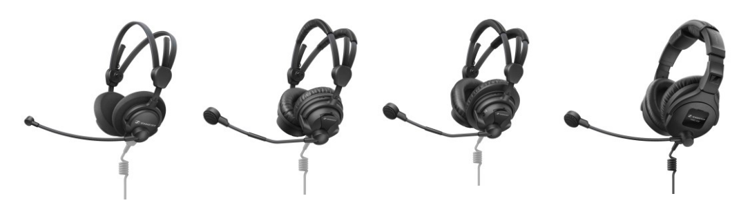
Sennheiser's portfolio of broadcast headsets has been streamlined and improved, pictured are (from left to right): the open HME 46; the closed, supra-aural HMD 26; the closed, circumaural HMDC 27 with NoiseGard active noise reduction; and the closed, circumaural HMD 300 X3K1 with included XLR-3/1/4" jack plug cable.

Last but not least, the closed, circumaural HMD 300 ActiveGard headset for backstage communications has been fitted with a new dynamic boom mic and arm, delivering improved performance. It is also available as a single-sided model (HMD 300 S), and as the cost-effective HMD 300 X3K1, which has the XLR-3/1/4" jack plug cable included. Except for the latter, all headsets need to be combined with a choice of XLR-3 / 1/4" jack, XLR-4F and XLR-5 M cables or unterminated cables (single and twin). All HME headsets are now designed to work with phantom power only.