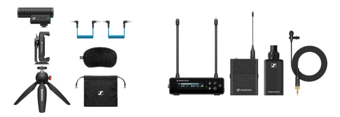
Global NAB promotion for the MKE 400, MKE 400 Mobile Kit (pictured, left) and all EW-DP UHF wireless microphone systems (pictured is the EW-DP ENG SET, right)

Promotional pricing commences Monday, April 15<sup>th</sup> and will run through Sunday, May 19<sup>th</sup>, 2024. Standard pricing will be back in effect on Monday, May 20<sup>th</sup>, 2024.